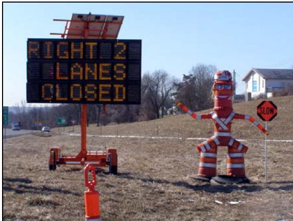
Barrel Betty at Northeast Parvin Road in Kansas City, Mo.