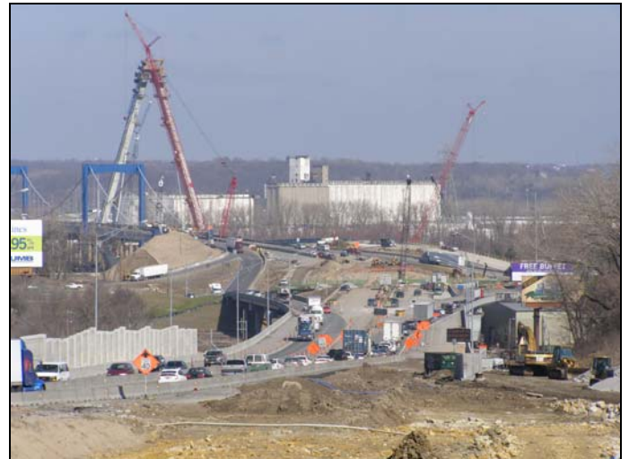
The Paseo ramp bridge demolition is complete. Excavation and grading work to construct the new interchange is under way.